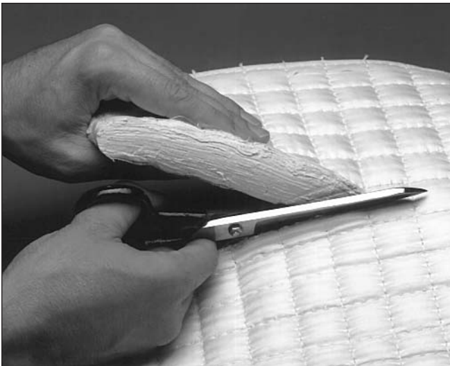
HSA Systems' unique ceramic fiber paper core is free of organics and may easily be cut with an ordinary pair of scissors.

The addition of a textile covering and quilting the composite gives it strength, while at the same time allows the system to remain flexible and formable, providing ease of fabrication. The finished HSA Systems are unaffected by moisture; if the material is wet by water or steam, all thermal and physical properties are restored upon drying. Also, a coating or foil cladding may be added to improve moisture and abrasion resistance.