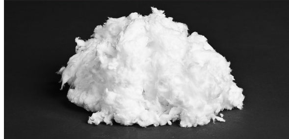
LA & HA Fibers

HX Fiber is processed to ensure that a high level of Alumina is converted into the extremely thermally stable alpha Alumina phase. This fiber is the most chemically resistant in the Saffil family of products.