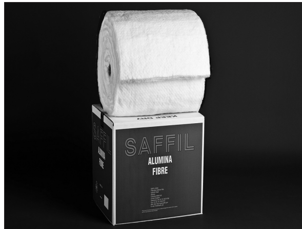
Saffil Blanket and Mat