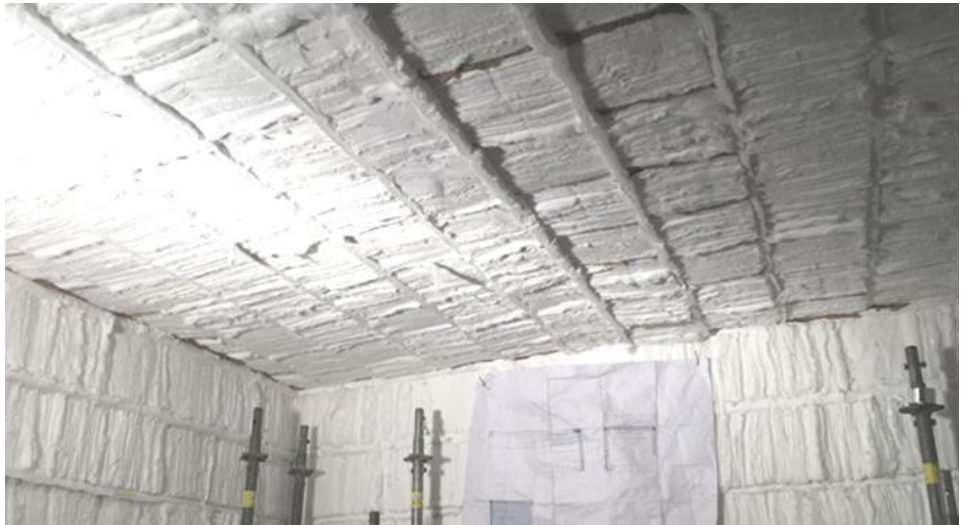
Photo-3 Module lining on the roof and walls before tamping

The rectangular furnace was about 9.500 metres long and 5.100 metres wide and 3.000 metres high. The modules were supplied as square blocks 300 x 300mm. The base of the furnace side walls were lined with a refractory castable. This was based on previous experience. In the past the fibre lining had suffered mechanical damage by the roller hearth. (Photo-4)