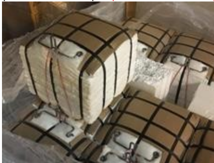
Photo-2 Modules with special straps

Photo-1 Lining drawing developed by Unifrax The lining was 300m thick Saffil M-Fil grade modules 110 kg/m 3 density, edge-stacked, with the RX2 type fixing system. The modules were installed over a back-up layer of Insulfrax SF Blanket (aluminium foil faced) 25mm thick, 128 kg/m 3 . The installation was a uni-directional system with a single batten of Fibermax Blanket, 13mm x 128 kg/m 3 between rows of modules compressed down to 9mm during installation. We worked closely with the client and supplied a special packaging system for the modules. In order to maintain the compressed width these modules are supplied with wooden side plates and banding straps. For this project we provide modules with carton (cardboard) plates and 6 straps. (Photo-2 & Photo-3)