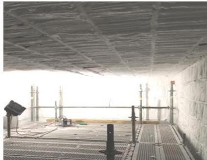
Photo-5 Lining during the installation

The installation of the lining was carried out quickly. An installation team of 6 people took one week to install around 850 modules successfully and the unit was put into service on schedule. (Photo-5)