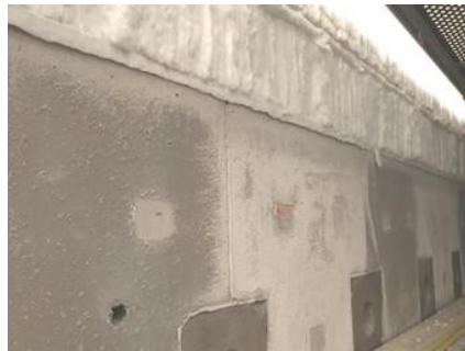
Photo-4 Refractory lining to the base of the walls

The rectangular furnace was about 9.500 metres long and 5.100 metres wide and 3.000 metres high. The modules were supplied as square blocks 300 x 300mm. The base of the furnace side walls were lined with a refractory castable. This was based on previous experience. In the past the fibre lining had suffered mechanical damage by the roller hearth. (Photo-4)