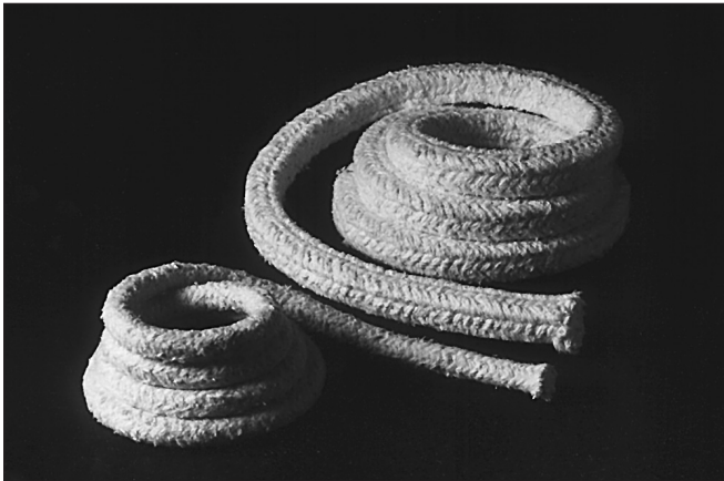
Fiberfrax Round and Square Braid