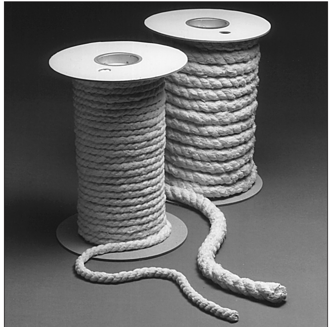
Fiberfrax Rope and HD Rope

Refer to the product Safety Data Sheet (SDS) for recommended work practices and other product safety information.