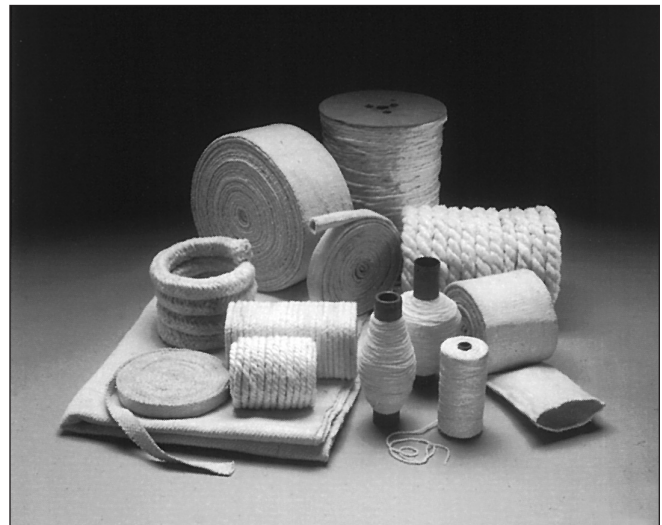
Fiberfrax Woven Textiles Product Family

For additional details on the available woven textile product forms, typical properties and applications for which they are appropriate, refer to Fiberfrax Woven Textiles, Product Information Sheet, Form C-1425.